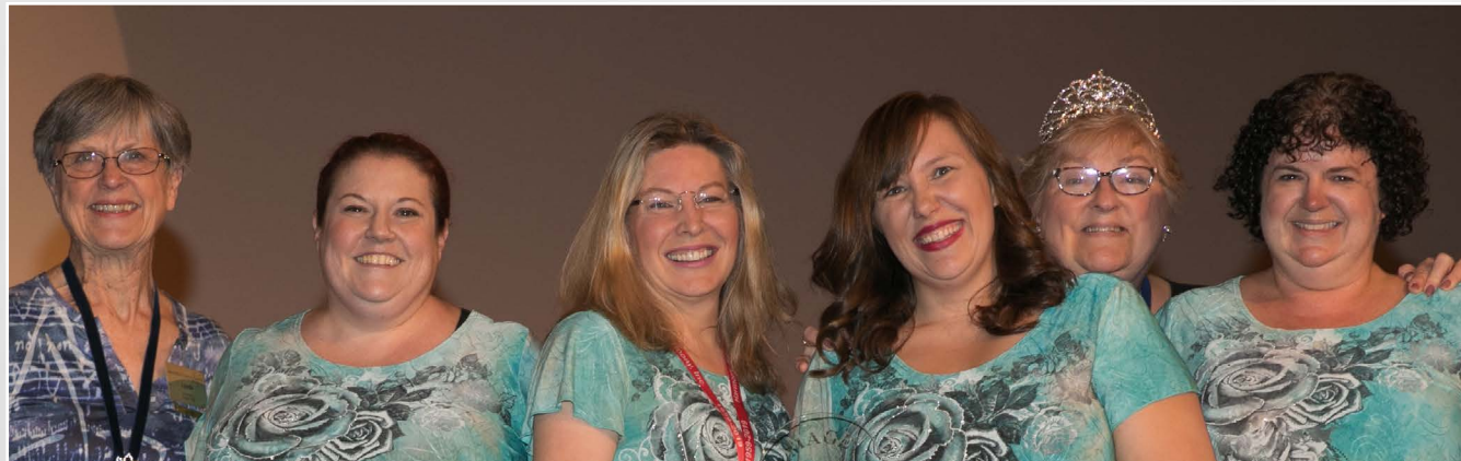
Image of Harmony Service Award

2019s honoree is Life's a Pitch , from Area 2's Women of Note . The Image of Harmony Award recognizes those quartets who not only sing together, but also work together. They go beyond what is expected of them in combined and individual ways to serve Harmony, Inc. , their Area, their Chapter, and their community. The award is sponsored by our 1997 Harmony Queens, Images .