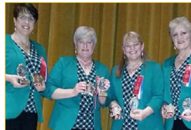
TOP: ScotianAires took first place at Area 1 AC&C.

Valley Voices presented the theme for 2017 in a full array of colours that kept the audience guessing at what the theme would be for next year. “Colour our