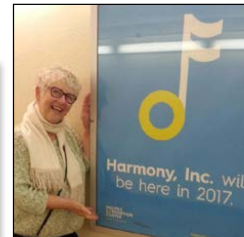
ABOVE: Next year in Halifax!