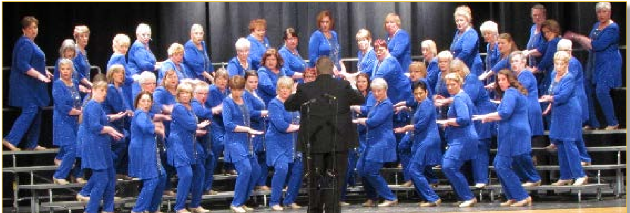
2016 Area 3 Chorus Champions A Cappella Showcase