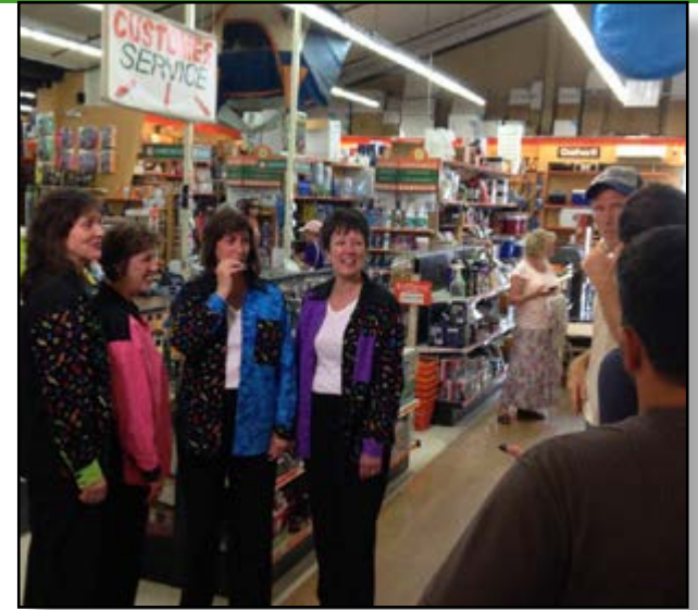
ABOVE: In Cahoots sings the jingle several times before filming to get the timing perfect.