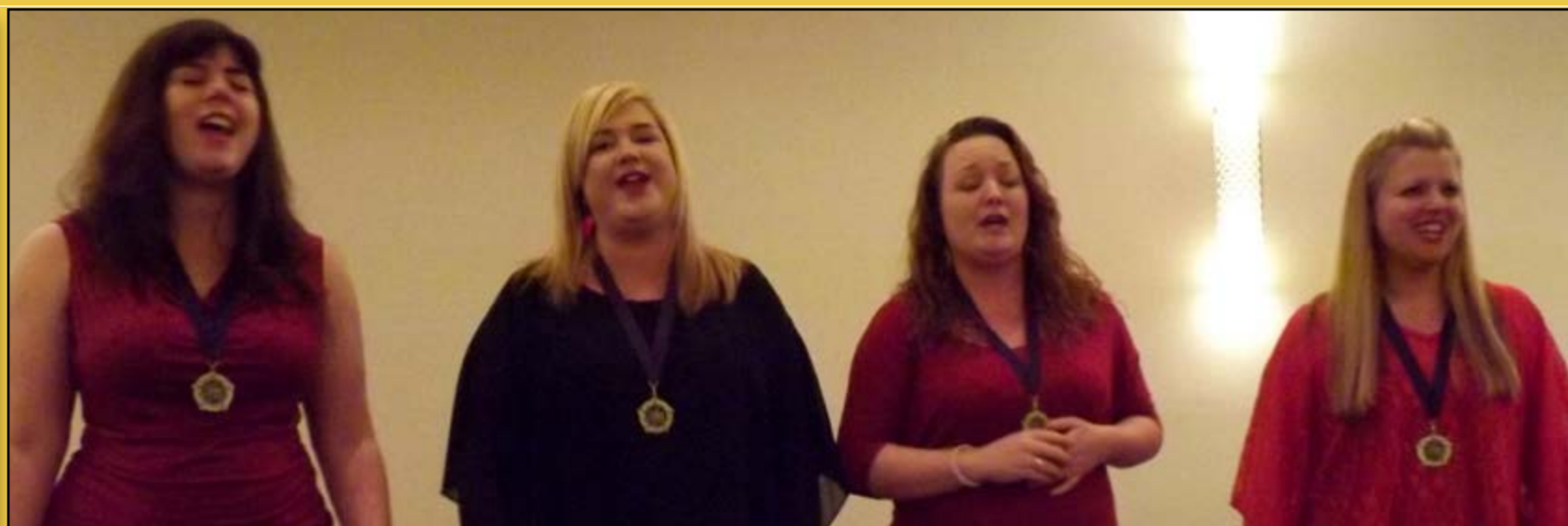
First Place Medalists Vocal Crush lift their voices in one more song at the moonglow.