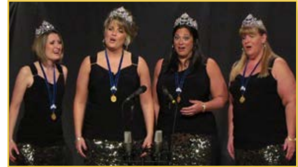
2015 Harmony Queens LiveWire