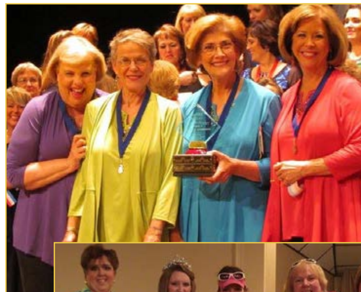
2016 Area 3 Quartet Champions