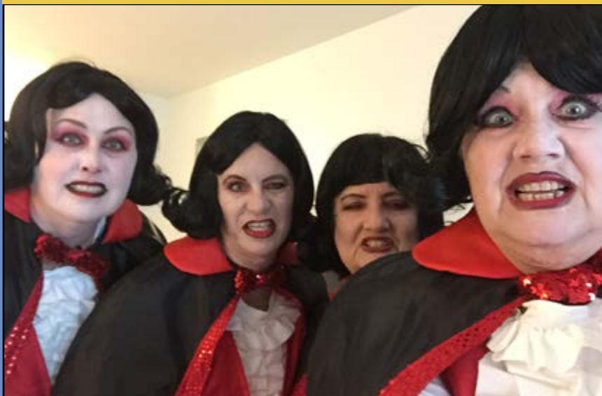
The Karamels, winners of the Kaleidoscope Award for highest Presentation score, model their signature facial expression.