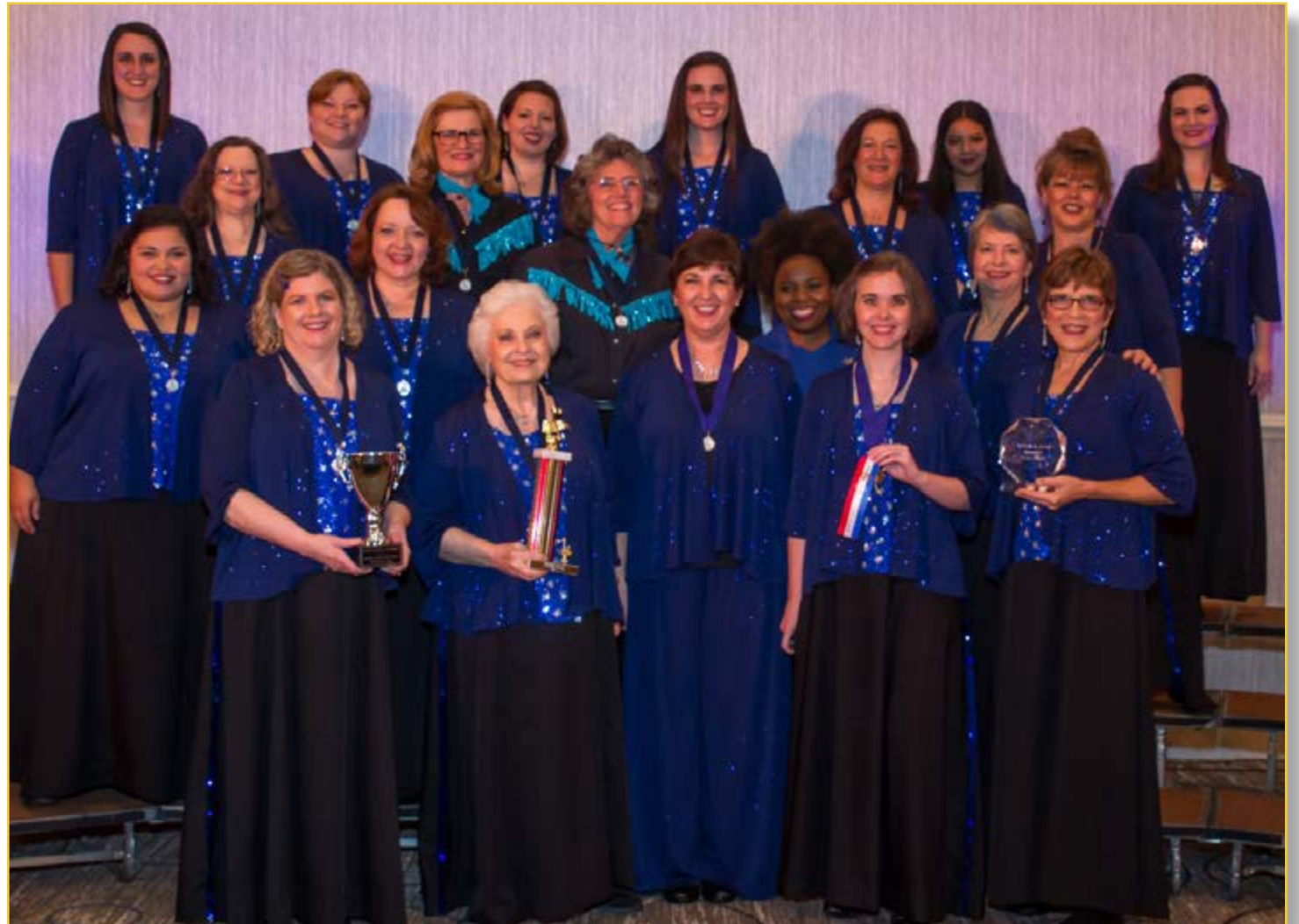
2016 Area 6 Champions Atlanta Harmony Celebration!