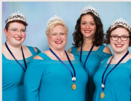
Taken 4 Granite • 2016