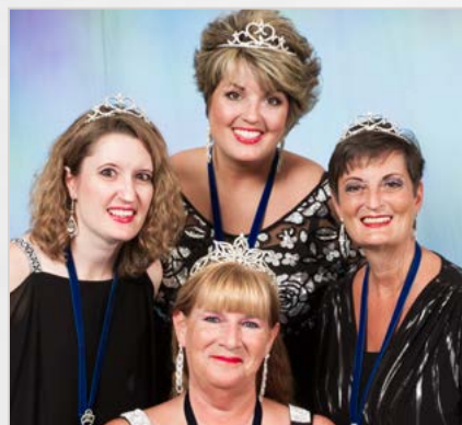
For Heaven's Sake • 1996