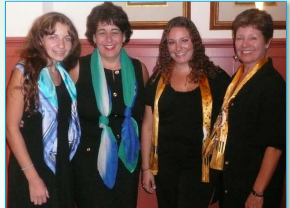
FIRST GIG — April 2014, the same month ATP finished 5th at AC&C.