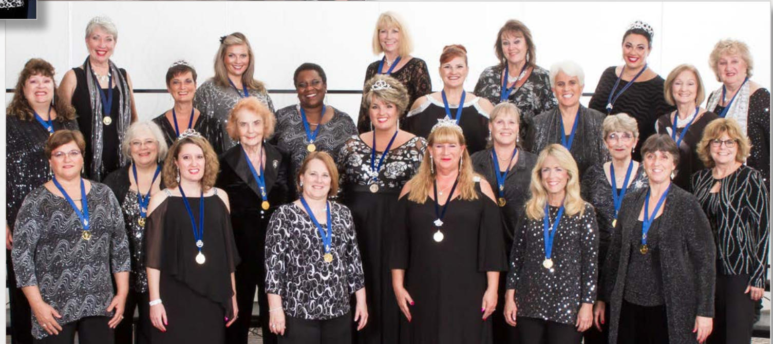
Northern Blend Chorus • 2017