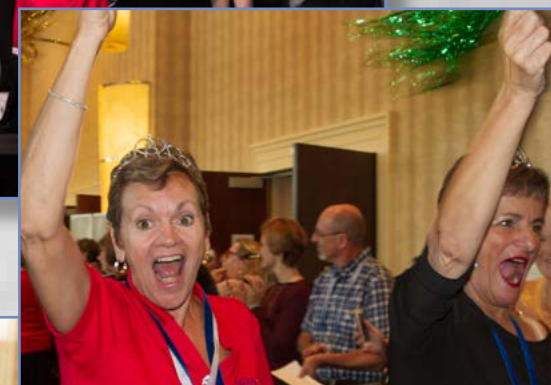
Harmony serenades the new queens.