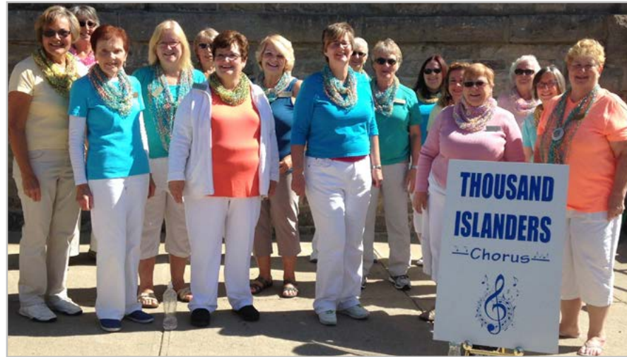
LEFT: Thousand Islanders perform at the outdoor Farmers Market in Downtown Brockville.