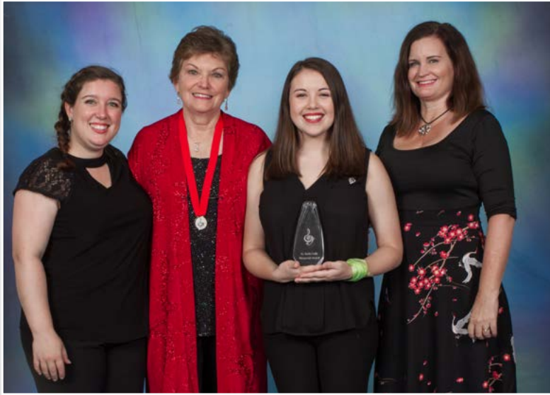
G. Ruth Geils Memorial Award Unaccompanied Minors