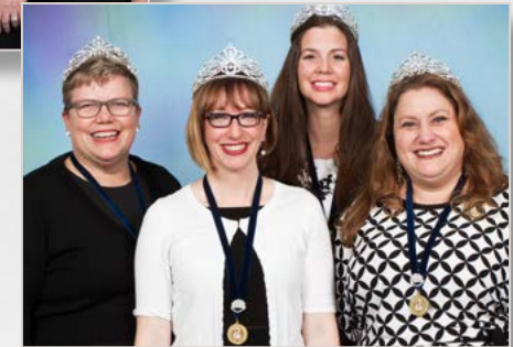
Foreign Exchange • 2011