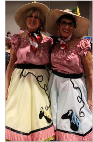
How-DY from the Crystal Chords!