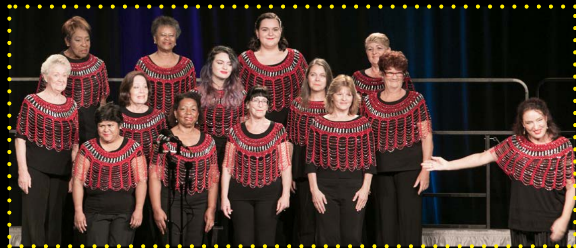
SOUTH LAKE A CAPELLA CHORUS , Area 6, Oakland, Florida, placed 3rd.

First place recognition brings the chance to enter the International Chorus Contest on Friday.