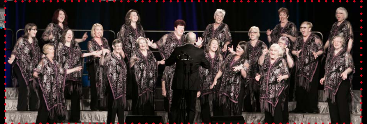
SHADES OF HARMONY , Area 5, London, Ontario, earned second place.