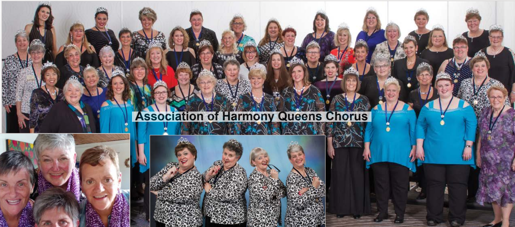
Association of Harmony Queens Chorus