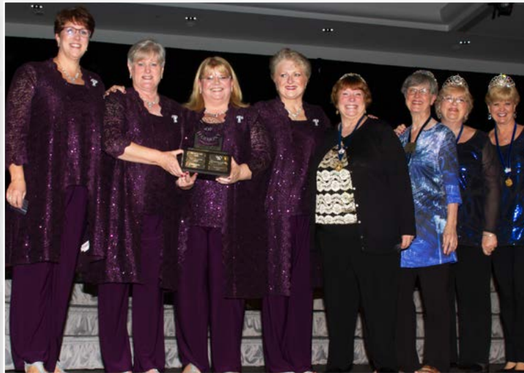
Accord Award Tonic!