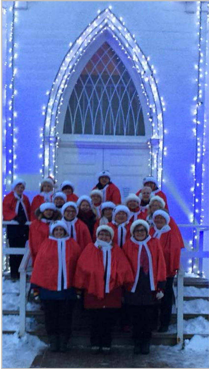
Thousand Islanders Chorus sings for "Alight the Night," a seasonal celebration in Upper Canada Village.