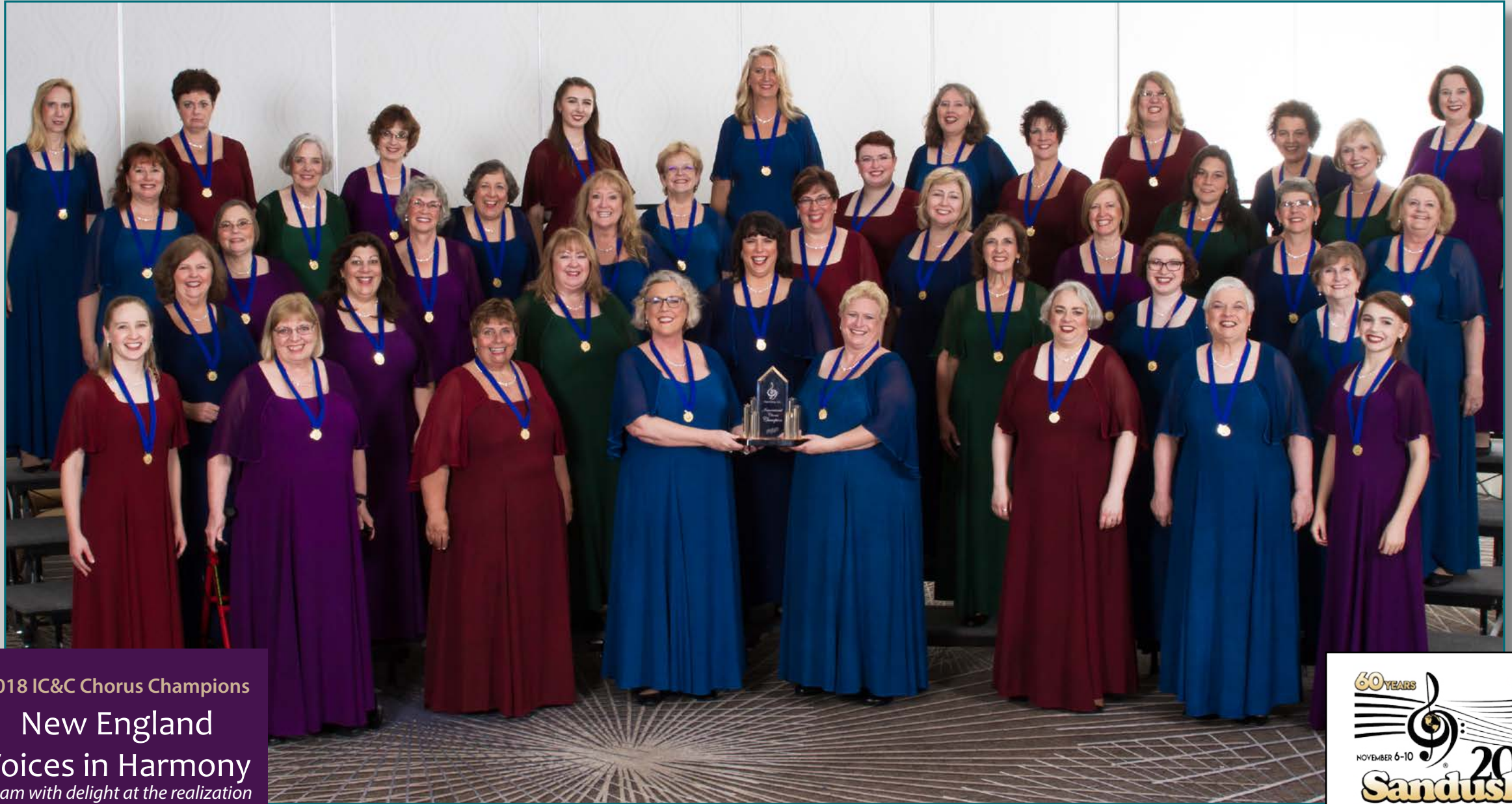
2018 IC&C Chorus Champions New England Voices in Harmony beam with delight at the realization that their dream is fulfilled. Congratulations, ladies!