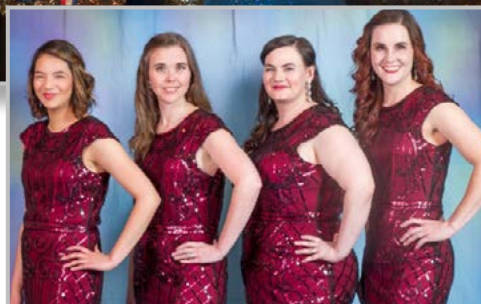
Atlanta Harmony Celebration! accepts their first-place awards at Area 6 AC&C.