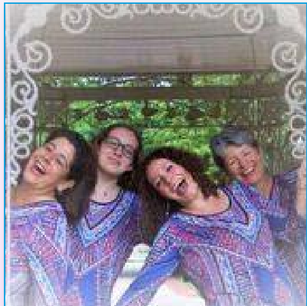
Aged to Perfection hangs out in the gazebo at Harmony University in Nashville, Tennessee.