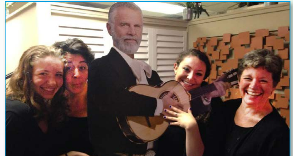
WORLD'S MOST INTERESTING MAN — "I don't always listen to barbershop, but when I do, I choose Aged to Perfection!"