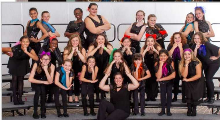
Unaccompanied Minors strike a pose at their first IC&C.