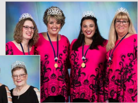
LiveWire • 2015