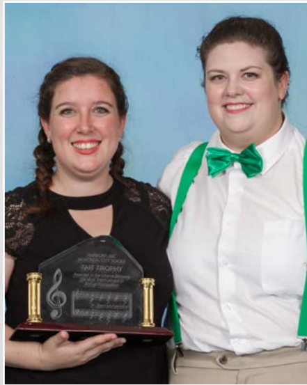
Montreal City Voices Tait Trophy Sisters of Sound