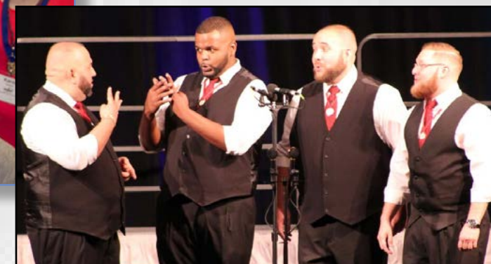
BHS 2018 Second-Place Medalist Quartet Signature entertains at Opening Ceremonies.