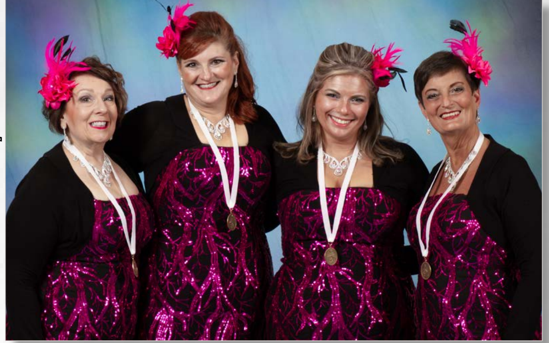
4th Place Balancing Act