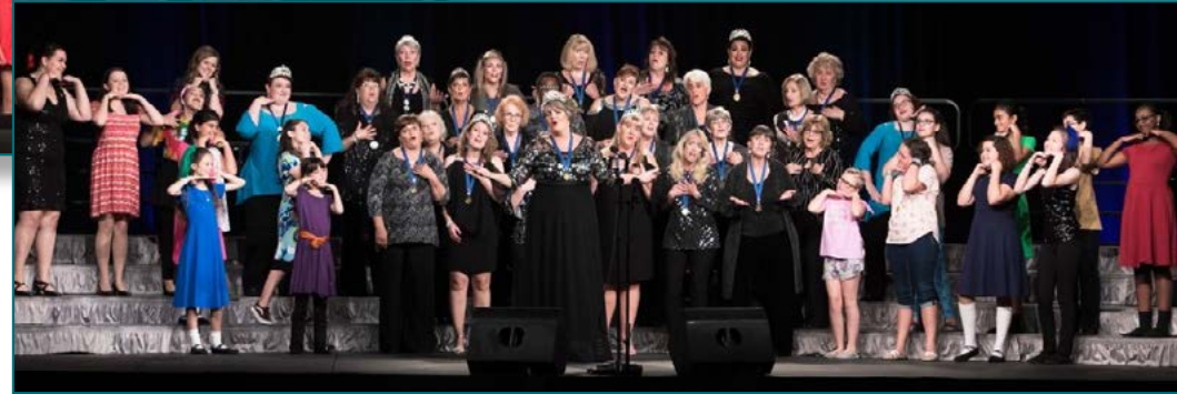
Minor Chords join Northern Blend during the Parade of Champions.