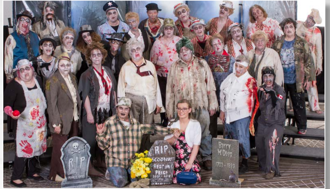
L.A.B.B.S. Trophy Niagara Frontier Chord Authority