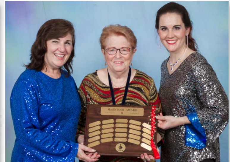
MacIntosh Award Atlanta Harmony Celebration