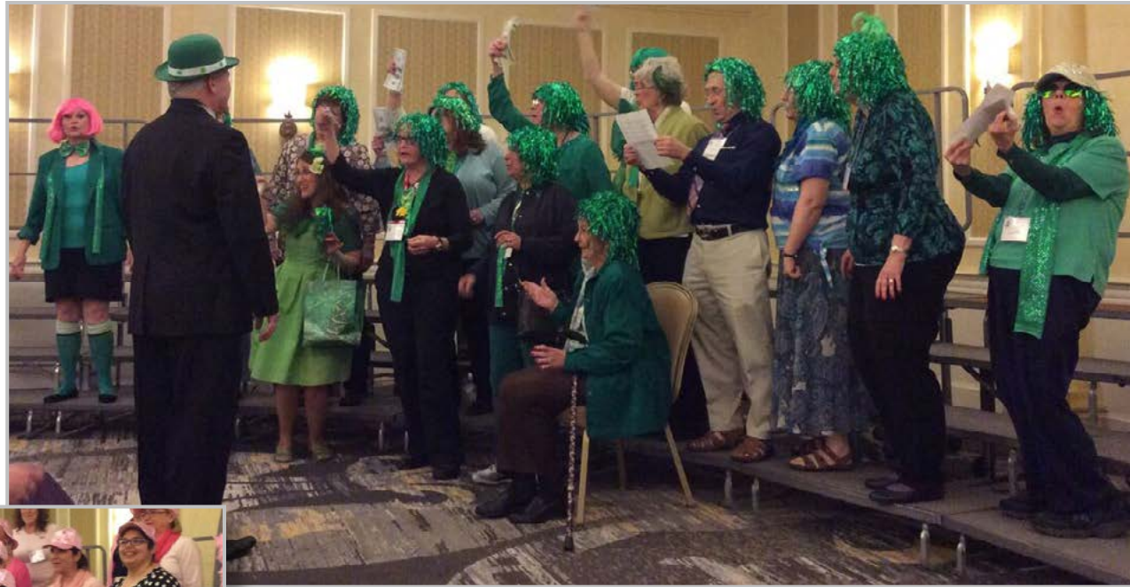
Harmony Heritage colors the world green at Area 2's 2018 moonglow.