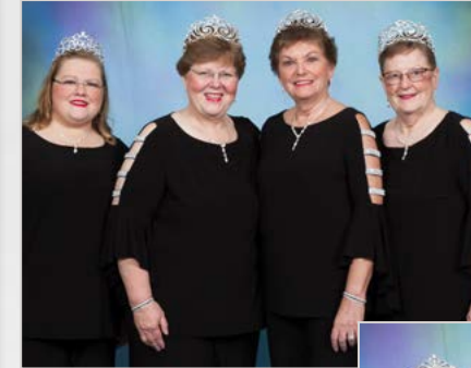
U4X • 2008