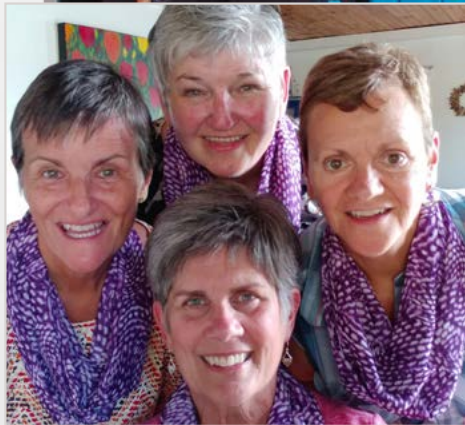
Spectrum • 1993 25-Year Honorees