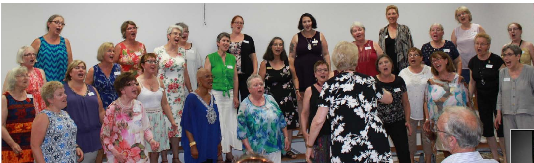
LEFT: Seaside A Cappella entertains at their July charter party.