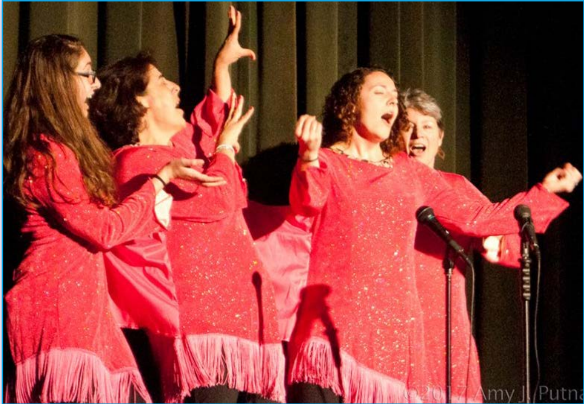
Sounds of the Seacoast asked ATP to sing Together, Wherever We Go as a Siamese quartet. It was challenging in the costume they provided!