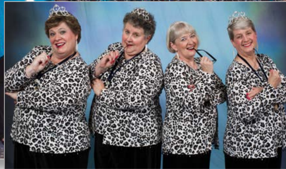
Change of Heart • 1999