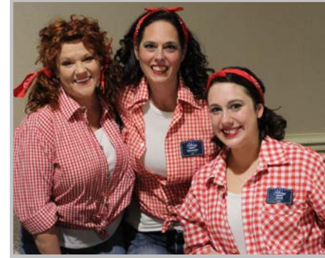
The Hee Haw Honeys of Entourage.

The moonglow acknowledged the Quartet Medalists, active Queens, and our Choruses with a performance for the membership. There was also that "special" treat by the judges, but you had to see it to believe it!