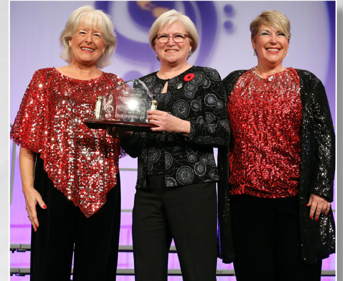
Montreal City Voices Tait Trophy Crystal Chords