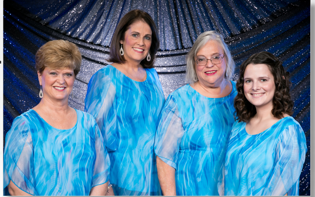
4th Place Roulette