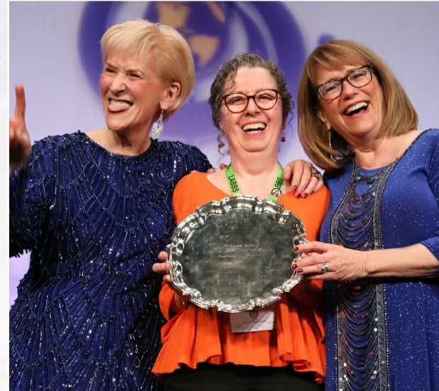
L.A.B.B.S. Trophy Seaside A Cappella