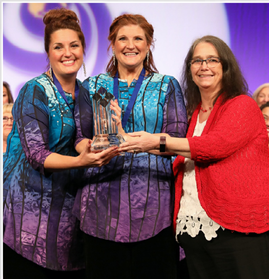
Jeanne O'Connor International Chorus Championship Trophy Northern Blend Chorus