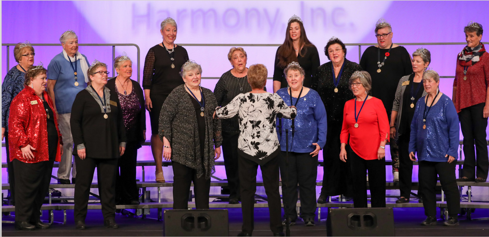
ASSOCIATION OF HARMONY QUEENS CHORUS