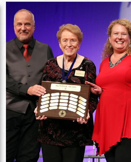
MacIntosh Award Lake Ridge Legacy Chorus