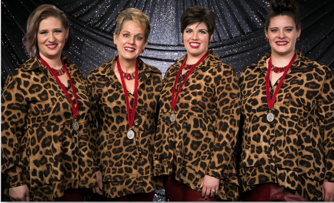
3rd Place Escapade