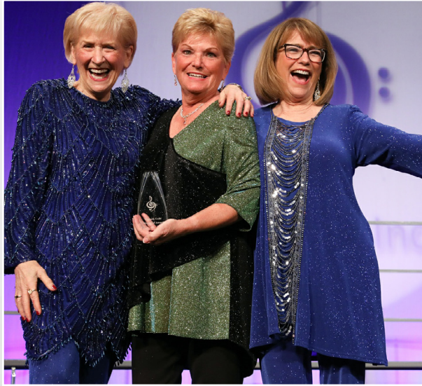
G. Ruth Geils Memorial Award Seaside A Cappella