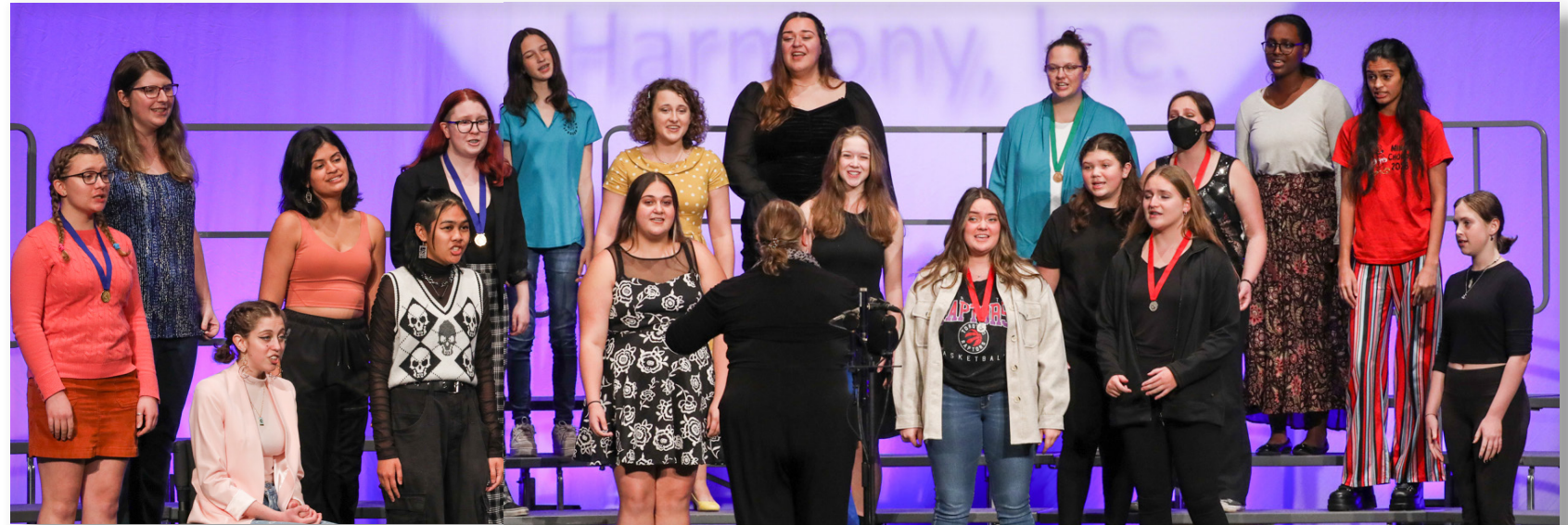
Minor Chords entertain at IC&C 2022 in Verona, NY.