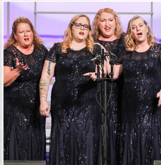
Accord Award Ring True