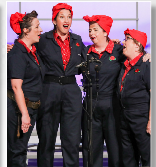
Findlay Plaque Serenade