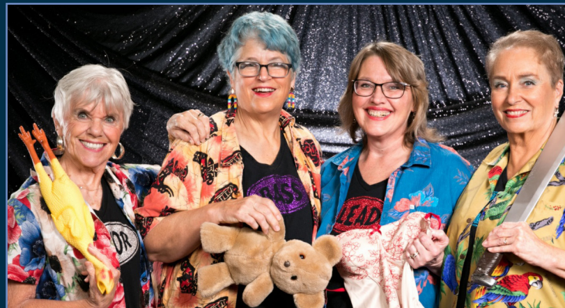
N2Q • Harmony Falls