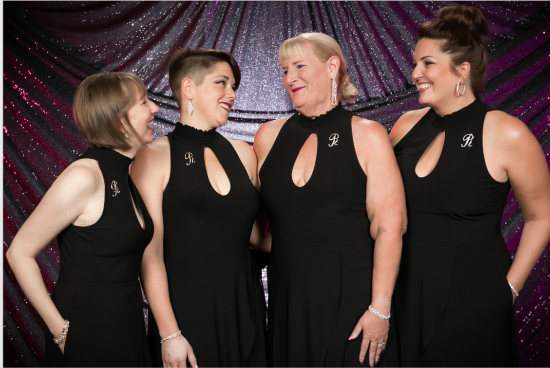
5th Place Lip Service