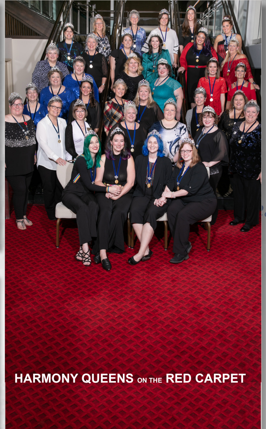
HARMONY QUEENS ON THE RED CARPET