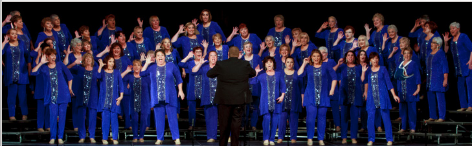
A CAPPELLA SHOWCASE • 2019 CHORUS CHAMPIONS