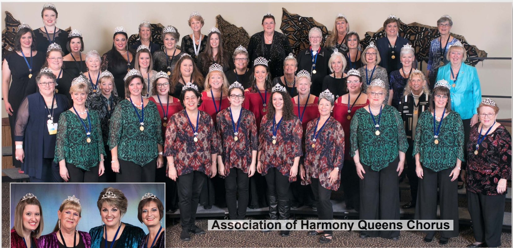
Association of Harmony Queens Chorus