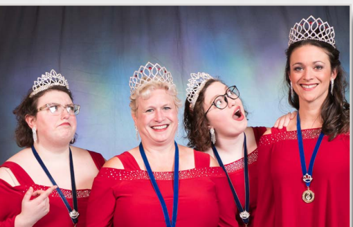
Taken 4 Granite • 2016