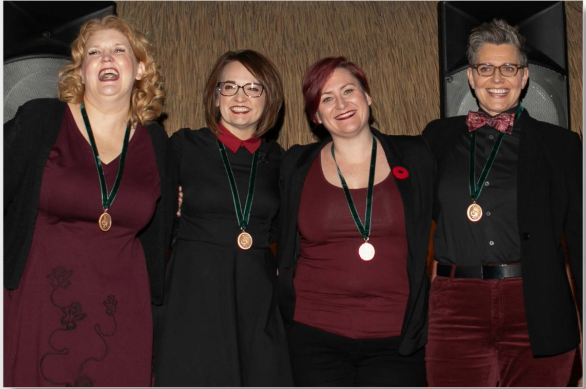
5th Place New Q