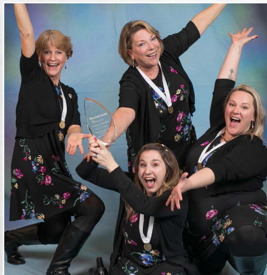
Accord Award Sweet Life