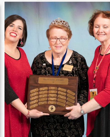
MacIntosh Award Bluegrass Harmony