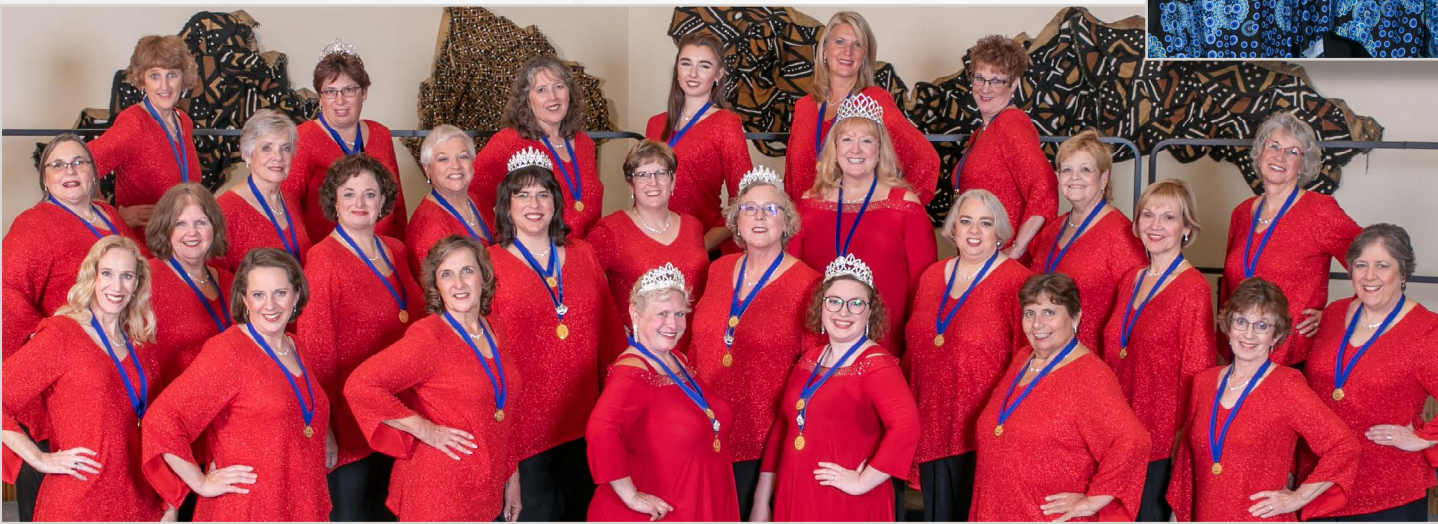
New England Voices in Harmony • 2018