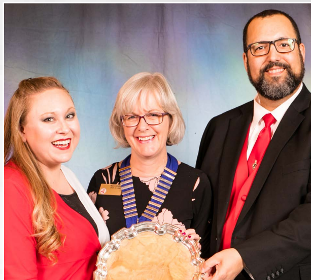
L.A.B.B.S. Trophy Bella Nova Chorus