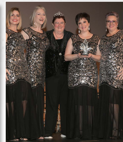
Findlay Plaque Resolution