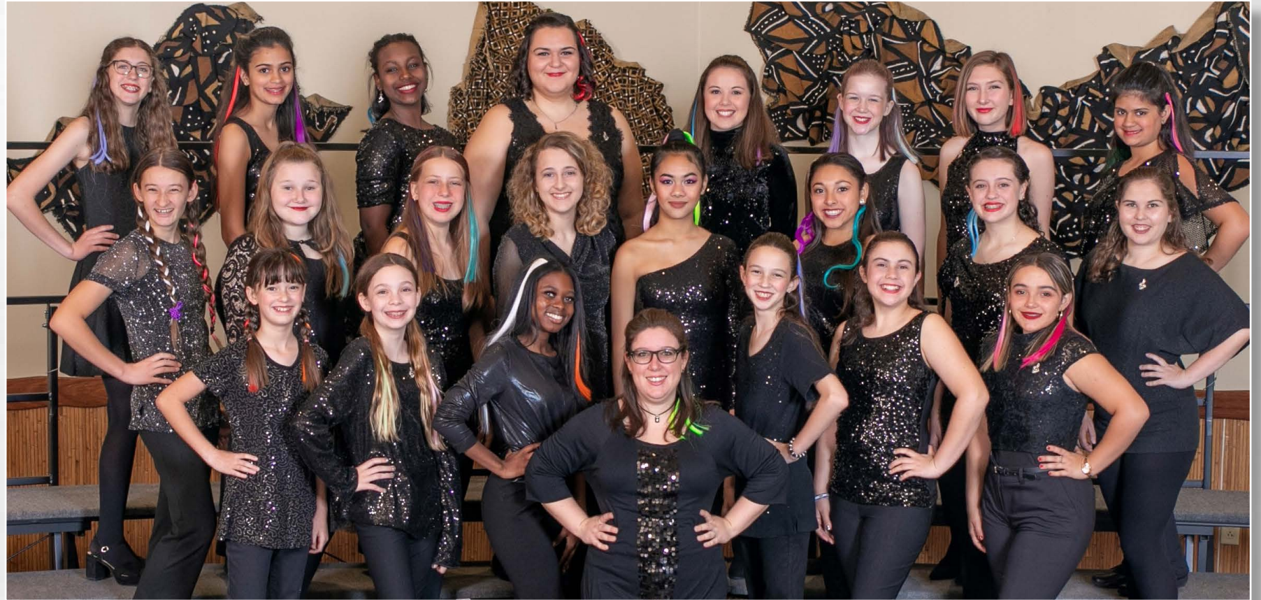
The 2019 Sandi White International Membership Increase Award winners are Unaccompanied Minors .

The 2019 recipient of the Sandi White International Membership Award, with a growth percentage of 45.5%, is Area 6's Unaccompanied Minors of Clermont, Florida.