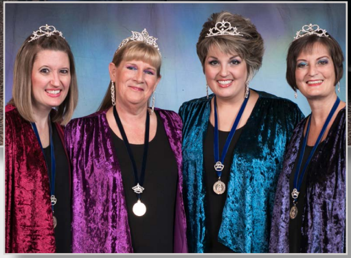
For Heaven's Sake • 1996