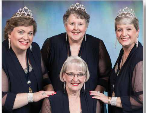
Change of Heart • 1999