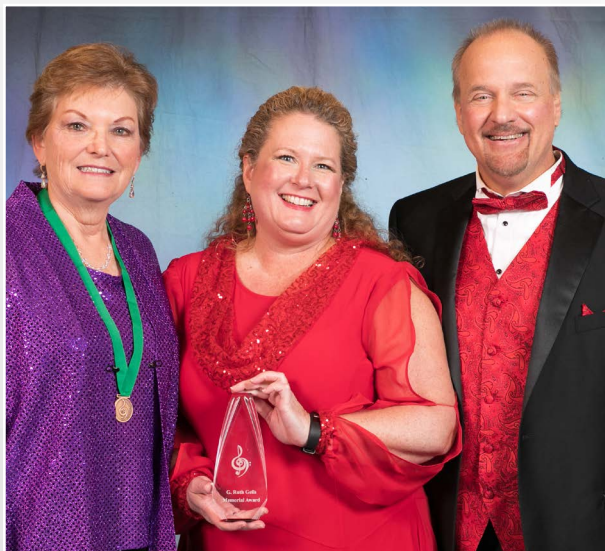
G. Ruth Geils Memorial Award Lake Ridge Legacy Chorus