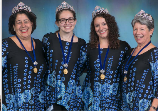
Aged to Perfection • 2018