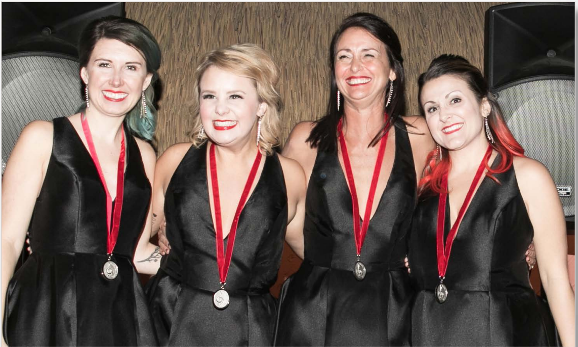
3rd Place Fierce