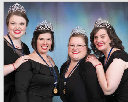
Spot On • 2013