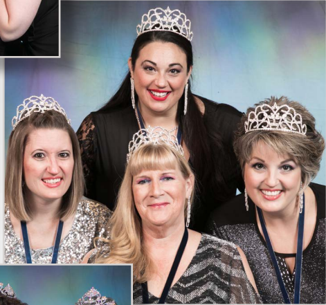
LiveWire • 2015