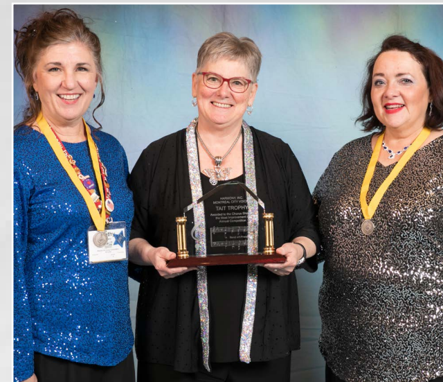
Montreal City Voices Tait Trophy Atlanta Harmony Celebration!