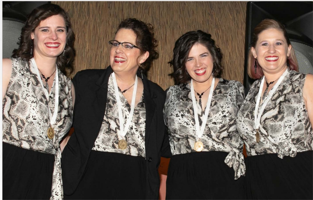
4th Place Swing Theory